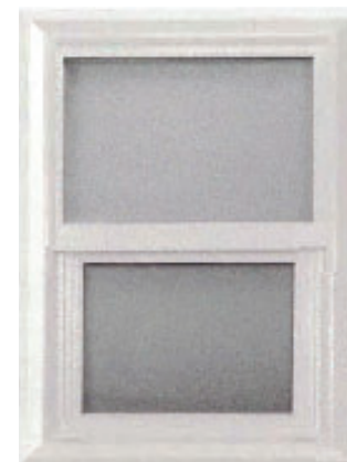
Single Hung Window, Obscure Glass